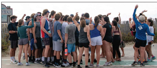
The boys and girls varsity crew teams ran Gurnet Road then came back to clean up trash. They got psyched up before beach sweep.